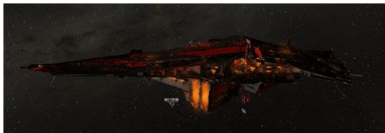
The Coalition Staging Fortizar, in all its majestic glory!

In coordination with long-standing allies such as XIX and SGGRN, Phoenix has begun the meticulous process of territorial consolidation. Jump clones have been established in 319-3D, and key doctrines seeded on the front. We do not pretend the road ahead will be easy. But few alliances are better suited to endure and overcome than our own. This is a test of will — and we intend to pass it.