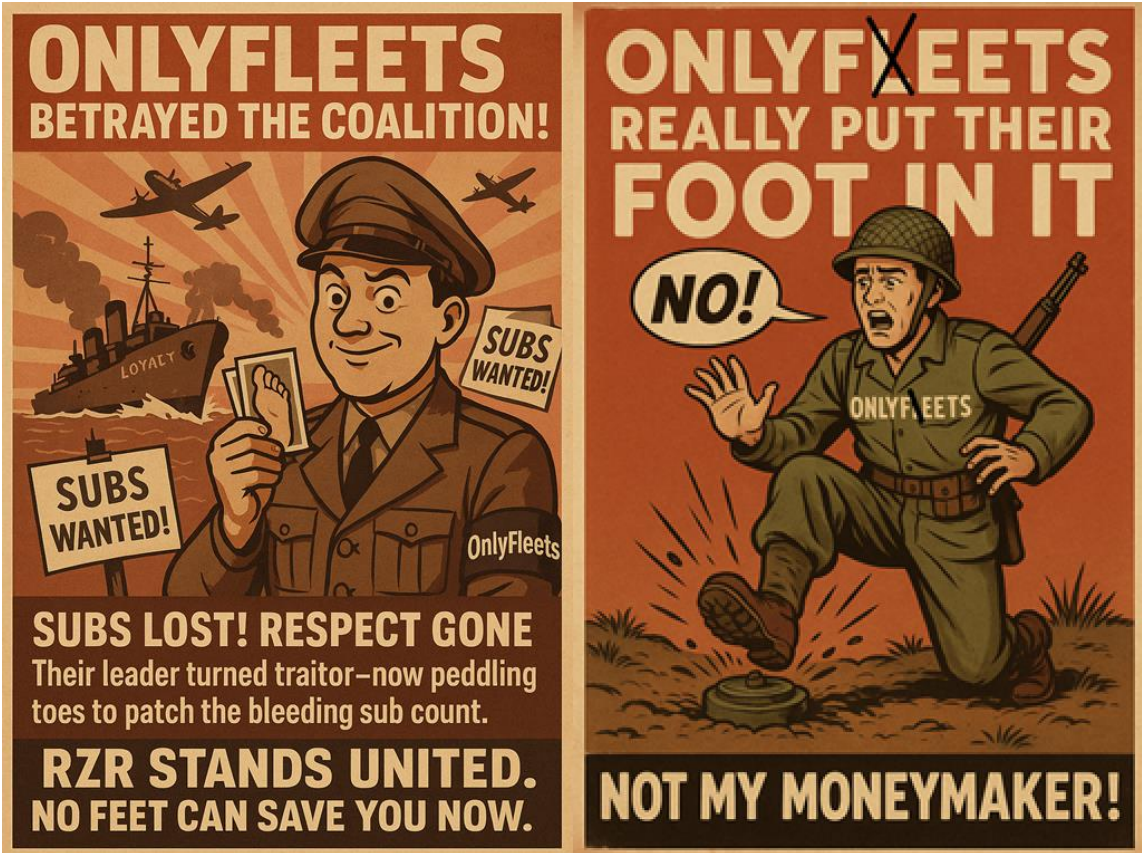
Onlyfleets internal leadership leaks!